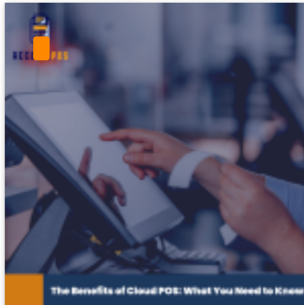
The Benefits of Cloud POS: What You Need to Know