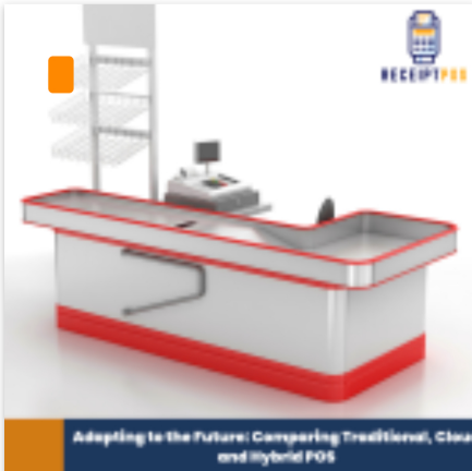
Adapting to the Future: Comparing Traditional, Cloud and Hybrid POS